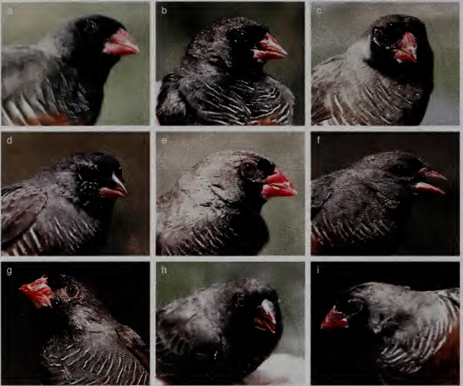
Figure 1. Plumage variation in west African quailfinch. All are males, except f = female. (a–f) Jos, Nigeria, October–November 1995 (a, -/y; b, UMMZ 233845; c, -/o; d, UMMZ 233846; e, -/r; f, -/G); (g) captive UMMZ 232576 (the specimen in Groth 1998); (h) Marakissa, The Gambia, September 1996; (i) Ngaoundere, Cameroon, male taken with four fledglings, UMMZ 232472.

ring in ugandae , though the white eye-ring is distinct in the holotype, FMNH 257709, taken near O. a. muelleri in southern Kenya. The dry woodland and steppe region of sub-Saharan Africa between Senegal and Sudan and into northern Uganda and western Kenya is a nearly continuous vegetation zone (Keay 1959, Moreau 1966). This region is separated by drier country from other vegetation zones where quailfinch occur, and we refer to the region where atricollis , ansorgei and ugandae occur as west Africa.